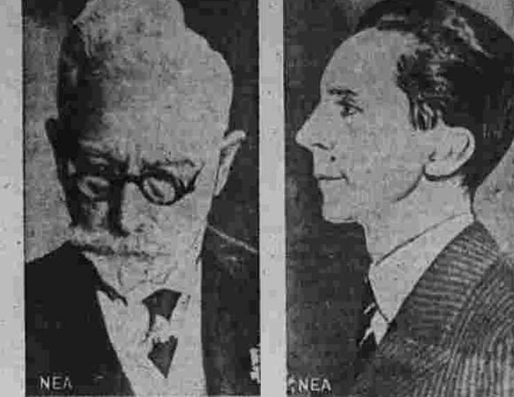
Watchfully Waiting It was reported by a reliable source that the German monarchy under Kaiser Wilhelm II (above) had been waiting for a signal to rise against a wall and shot to death.