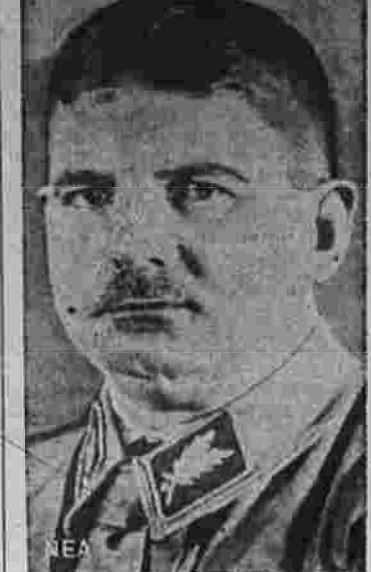
Nazi Victim No. 1 Captain Ernst Roehm (above), Sturm Troop leader, who reportedly plotted against Hitler, was shot up against a wall and shot to death.